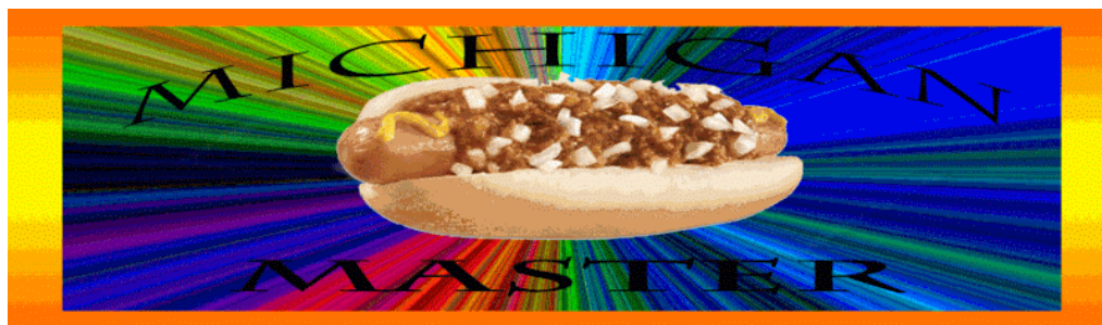
Michigan Master logo